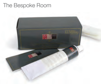
The Bespoke Room